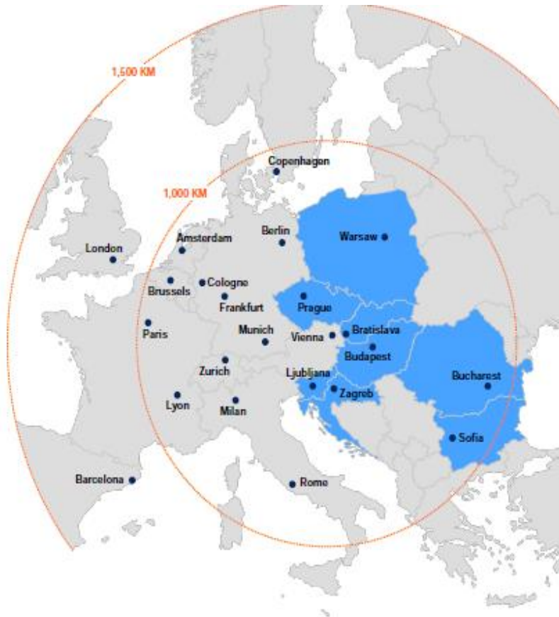
Figure 2. Strategic location of CEE countries

investing in Central or Eastern Europe have access to a market of 508.4 million inhabitants (Eurostat, 2016b) with a combined GDP (PPP) of approximately 14.64 trillion euros (18.74 trillion US dollars) in 2015 (Eurostat, 2016c; CIA, 2016).