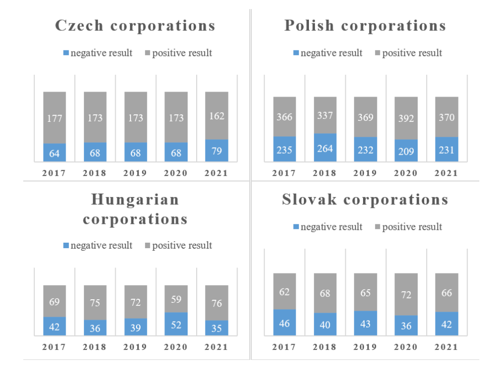
Figure 1. Trends in profitability of surveyed companies 2017–2021 (data: number of companies).