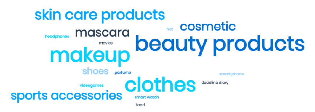
Table 4. Types of products they have bought

Another important question was: "What kind of green influencers they are following?" I also made a word cloud out of the answers.