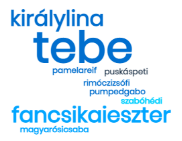
Table 5. Most followed green influencers by the answers

As you can see in Table 5. most of the influencers seen in this picture are in connection with veganism in one way or another. Also, Tebe is a shop but also the name of an influencer's brand. They sell products without any packaging.